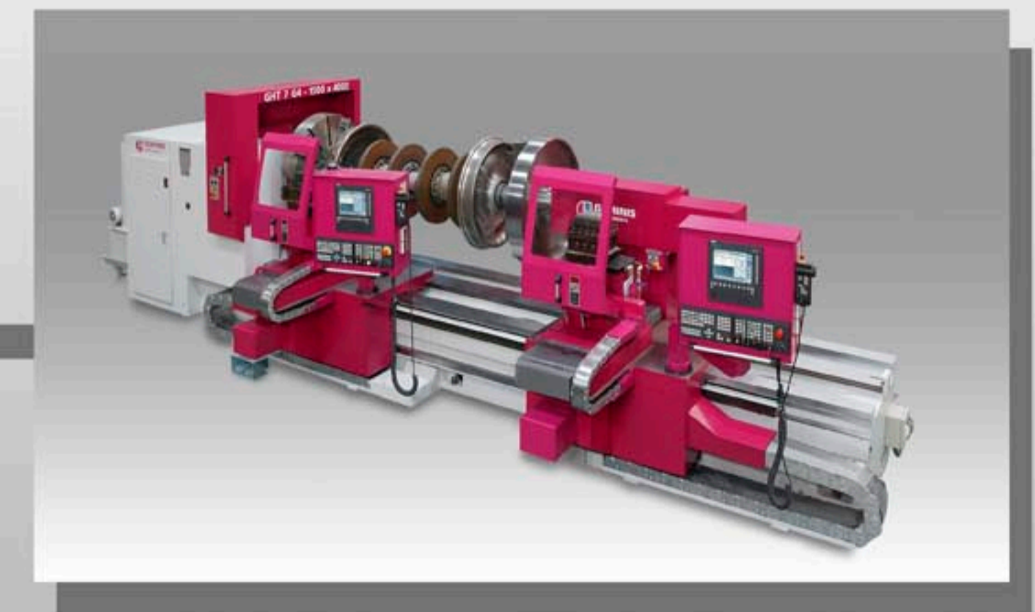
IRON & STEEL INDUSTRY RAILWAY INDUSTRY